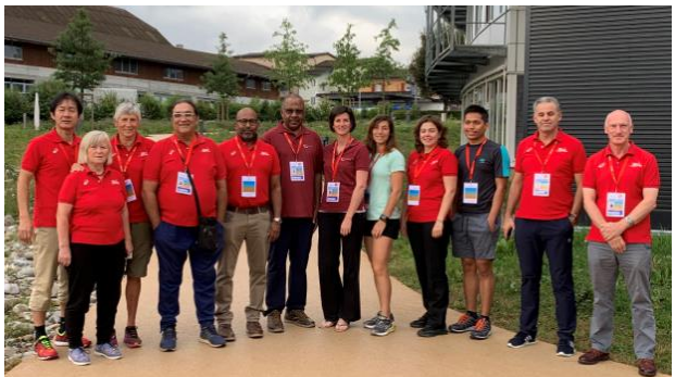
World Junior Para Athletics Championship 2019, Nottwil, CH https://www.youtube.com/watch?v=1K13HbMhr6Q

Handisport 2019, Paris, France http://www.handisport-open-paris.org/