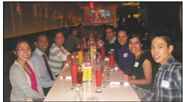
Students enjoy a time of mingling and dining with faculty and residents at the annual Geriatrics Interest Group Meet

with faculty and residents to discuss their interest in geriatric medicine.