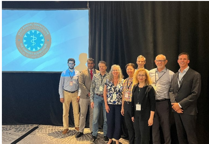
OEMAC 2024 Edmonton