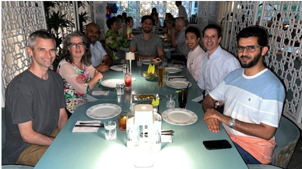
Annual Resident and Fellow Dinner