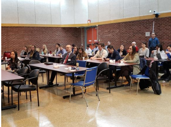
Our engaged Faculty and Residents